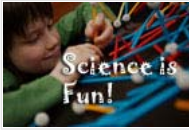
Science is Fun!