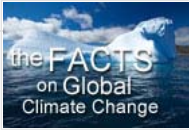
Facts on Global Climate Change

Return to top | RSS Feeds | What is RSS? | Sitemap | Contact Us | Tell Your Member