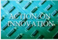
Action on Innovation