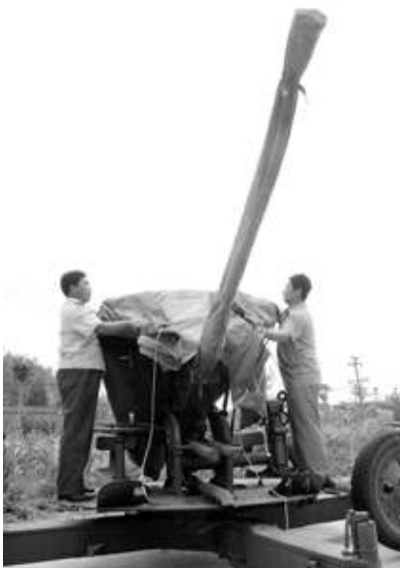
In China's active cloud-seeding efforts, anti-aircraft guns are used to shoot silver iodide crystals into the atmosphere. Beijing promises an intensive effort to clear the skies when the city hosts the Olympics in 2008.

In September 2001, the U.S. Climate Change Technology Program quietly held an invitational conference, “Response Options to Rapid or Severe Climate Change.” Sponsored by a White House that was officially skeptical about greenhouse warming, the meeting gave new status to the control fantasies of the climate engineers. According to one participant, “If