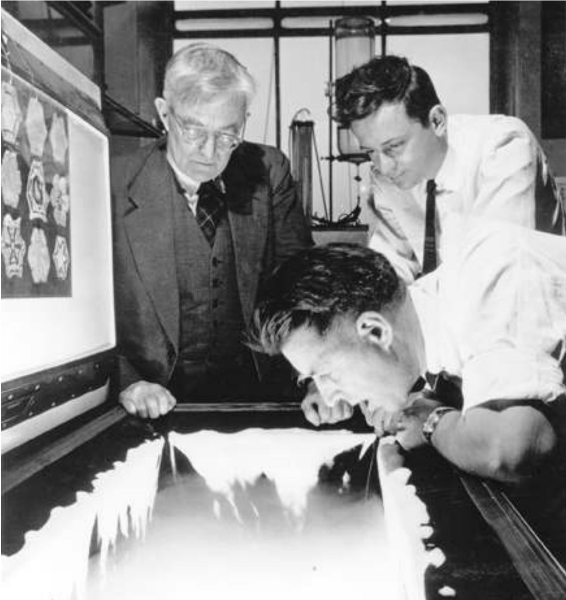
Vincent Schaefer reenacts the chance 1946 discovery that sparked fresh weather-control experiments as Irving Langmuir (left) and Bernard Vonnegut watch.

From this moment on, in the press and before the meteorological community, Langmuir expounded his sensational vision of large-scale weather control, including redirecting hurricanes and changing the arid Southwest into fertile farmland. His first paper on the subject used familiar military terminology to explain how a small amount of “nucleating” agent such as dry ice, silver iodide, or even water could cause a “chain reaction” in cumulus clouds that poten-