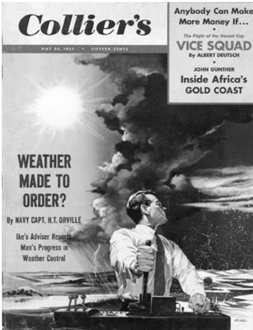
Experiments with cloud seeding during the Cold War inspired fantastic predictions about America's ability to control the weather, as in this 1954 article, and use it as a weapon against its communist adversaries.

“the science of things that aren’t so.” Yet there is hardly any scientific foundation for most claims about weather modification. Cloud seeding apparently can augment “orographic” precipitation (which falls on the windward side of mountains) by up to 10 percent. It is also possible to clear cold fogs and suppress frost with heaters in very small areas. That is the extent of what has been proved. Nevertheless, millions are still spent on cloud seeding today, largely by local water and power companies.