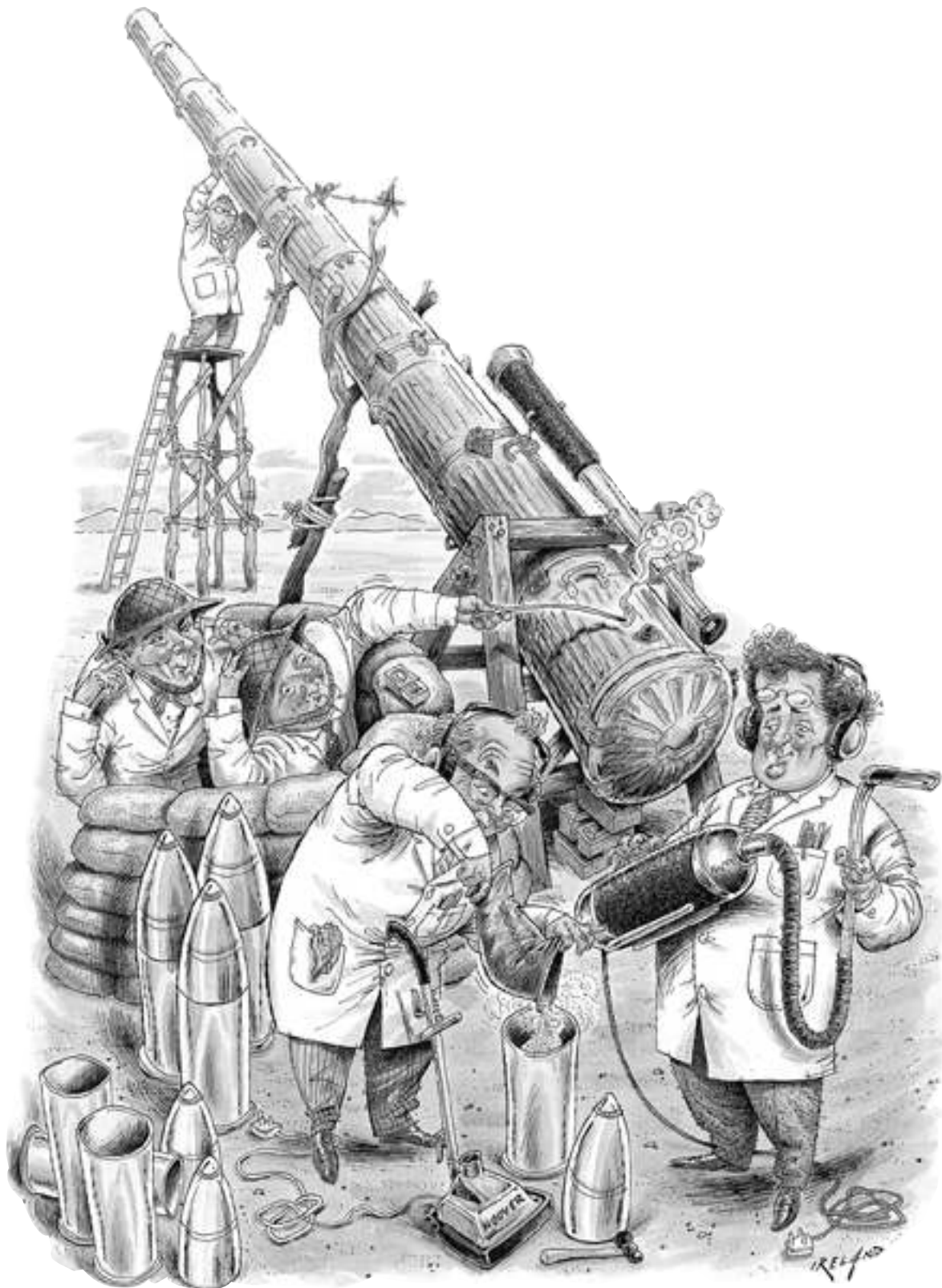
Ridicule greeted a 1992 proposal to combat global warming by shooting reflective particles into the atmosphere. The response could be different today.