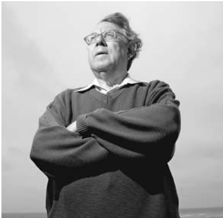
Nobel laureate Paul J. Crutzen favors a planetary “shade.”

As the sole historian at the NASA conference, I may have been alone in my appreciation of the irony that we were meeting on the site of an old U.S. Navy airfield literally in the shadow of the huge hangar that once housed the ill-starred Navy dirigible U.S.S. Macon . The 785-foot-long Macon , a technological wonder of its time, capable of cruising at 87